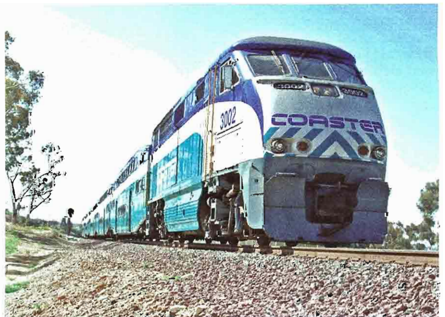
The COASTER is the antidote to the gridlocked commute.