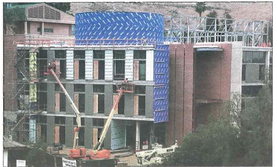
The Health Sciences Research Building, currently under construction, will serve as the initial research platform for the UCR School of Medicine. Another campus building will be renovated to create the School of Medicine Education Building.